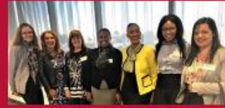
At the Diversity in Business Chamber Breakfast in August