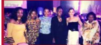
Diversity in Business Committee members and guests at the Gender Mainstreaming Awards